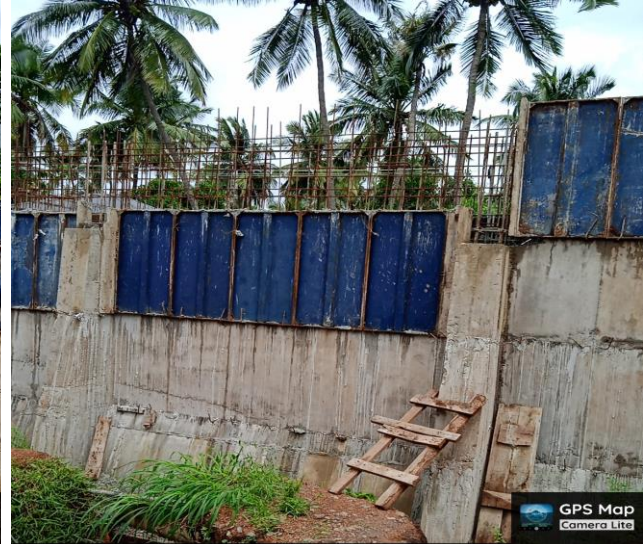
XGMQ+G9M, Palakkad, Kerala 678591, India

Latitude 10.9838133333333334° Longitude 76.53827° Local 11:25:09 AM Altitude 93 m GMT 05:55:09 AM Friday, 21.07.2023