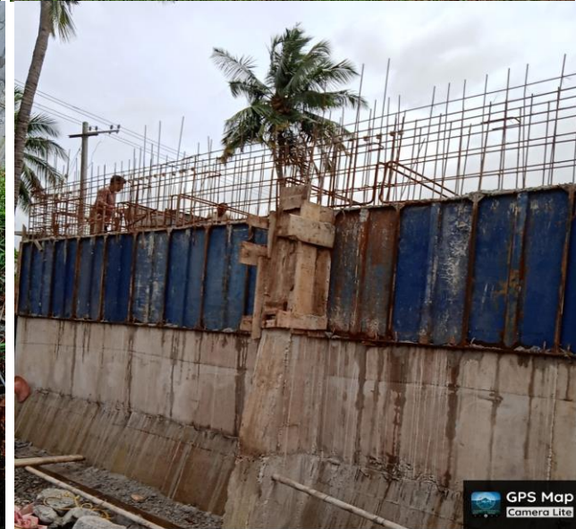
XGMQ+G9M, Palakkad, Kerala 678591, India

Latitude 10.9838266666666667° Longitude 76.538295° Local 11:22:18 AM Altitude 89 m GMT 05:52:18 AM Friday, 21.07.2023