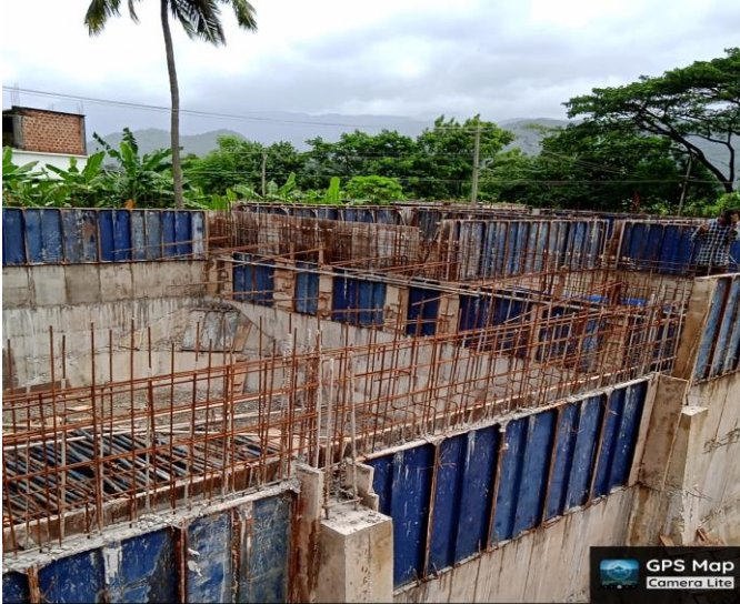
XGMQ+G9M, Palakkad, Kerala 678591, India

Latitude 10.9838133333333334° Longitude 76.53827° Local 11:25:09 AM Altitude 93 m GMT 05:55:09 AM Friday, 21.07.2023