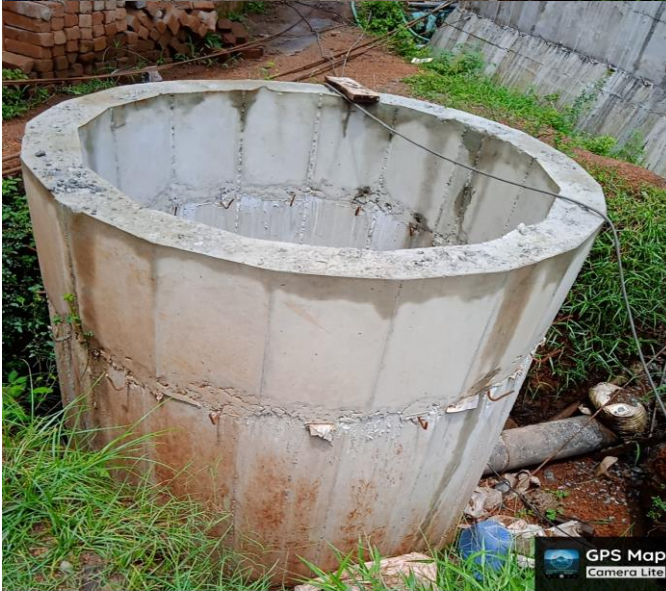
XGMQ+G9M, Palakkad, Kerala 678591, India

Latitude 10.9838266666666667° Longitude 76.538351666666666° Local 11:22:15 AM Altitude 89 m GMT 05:52:15 AM Friday, 21.07.2023