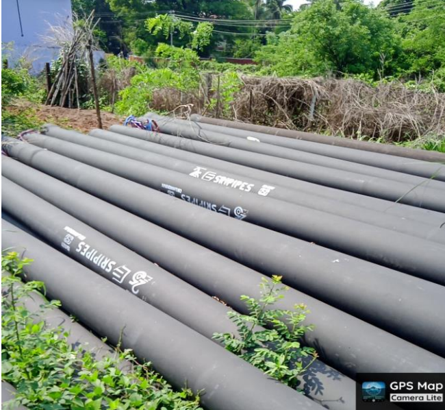
QHCV+P4J, Melamuri Kottayi Rd, Pirayiri, Kerala 678006, India

Latitude 10.771654999999999° Longitude 76.59275666666667° Local 09:57:51 AM Altitude 73 m GMT 04:27:51 AM Tuesday, 30.05.2023