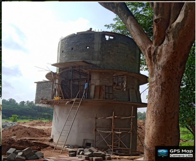
Chakkanthara, Palakkad, Kerala 678006, India

Latitude 10.750328333333334° Longitude 76.5604° Local 10:11:50 AM Altitude 90 m GMT 04:41:50 AM Tuesday, 30.05.2023