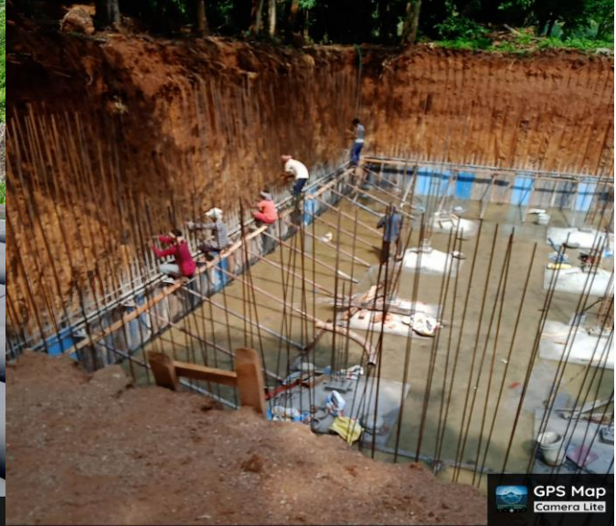
Thachangad - Kuthiramada Temple Rd, Mathur East, Kerala 678571, India

Latitude 10.771654999999999° Longitude 76.59275666666667° Local 09:57:51 AM Altitude 73 m GMT 04:27:51 AM Tuesday, 30.05.2023