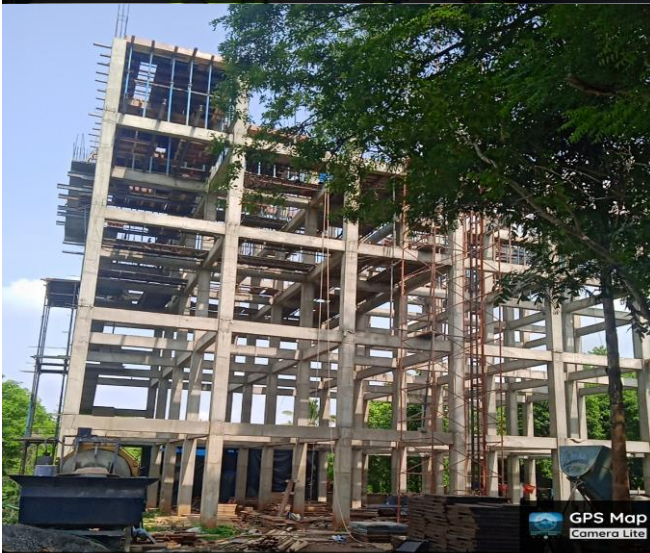
Mathur, Kerala, QH26+289, Mathur West, Kerala 678571, India

Latitude 10.765025° Longitude 76.58360833333333° Local 09:40:12 AM Altitude 70 m GMT 04:10:12 AM Tuesday, 30.05.2023