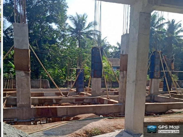
GPS Map Camera Lite QG9V+58P, Mankara-Palakkad Rd, Kottayi, Kerala 678572, India Latitude 10.767805° Longitude 76.54348° Local 09:42:11 AM Altitude 90.3 meters GMT 04:12:11 AM Wednesday, 28.12.2022