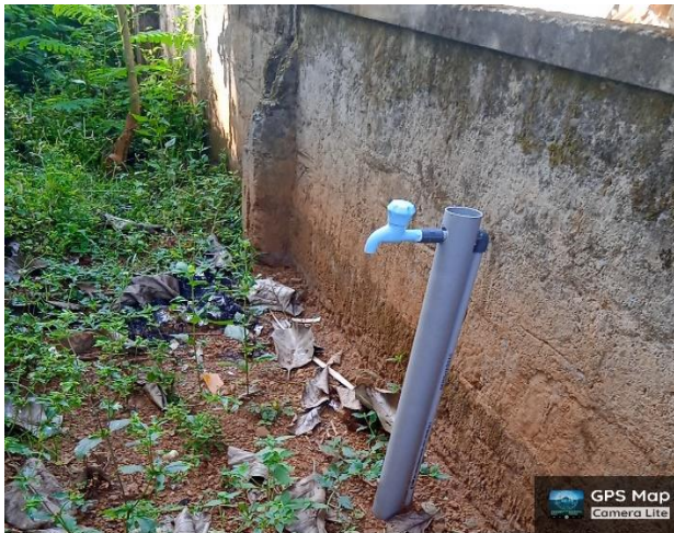
GPS Map Camera Lite QG9R+3PC, Chembai Gramam Rd, Chembai Gramam, Kerala 678572, India Latitude 10.767156666666665° Longitude 76.54182166666666° Local 09:54:50 AM Altitude 83.4 meters GMT 04:24:50 AM Wednesday, 28.12.2022