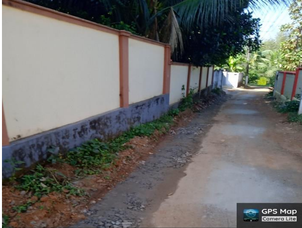
GPS Map Camera Lite QG9R+3PC, Chembai Gramam Rd, Chembai Gramam, Kerala 678572, India Latitude 10.767295° Longitude 76.54163833333334° Local 09:52:00 AM Altitude 88.8 meters GMT 04:22:00 AM Wednesday, 28.12.2022