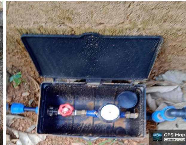
GPS Map Camera Lite QG9R+3PC, Chembai Gramam Rd, Chembai Gramam, Kerala 678572, India Latitude 10.767176666666668° Longitude 76.54179833333333° Local 09:54:43 AM Altitude 81.9 meters GMT 04:24:43 AM Wednesday, 28.12.2022