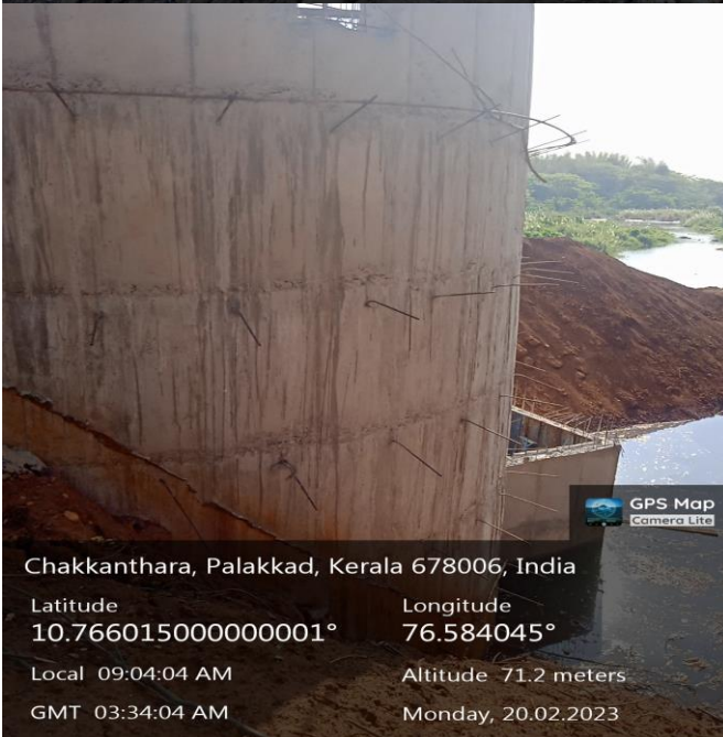
Chakkanthara, Palakkad, Kerala 678006, India Latitude 10.7660150000000001° Longitude 76.584045° Local 09:04:04 AM Altitude 71.2 meters GMT 03:34:04 AM Monday, 20.02.2023