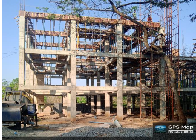
Mathur, Kerala, QH26+289, Mathur West, Kerala 678571, India Latitude 10.7503616666666667° Longitude 76.56041° Local 08:42:24 AM Altitude 86.1 meters GMT 03:12:24 AM Monday, 20.02.2023