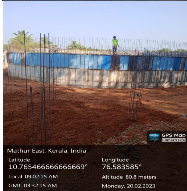
Mathur East, Kerala, India Latitude 10.7654666666666669° Longitude 76.583585° Local 09:02:15 AM Altitude 80.8 meters GMT 03:32:15 AM Monday, 20.02.2023