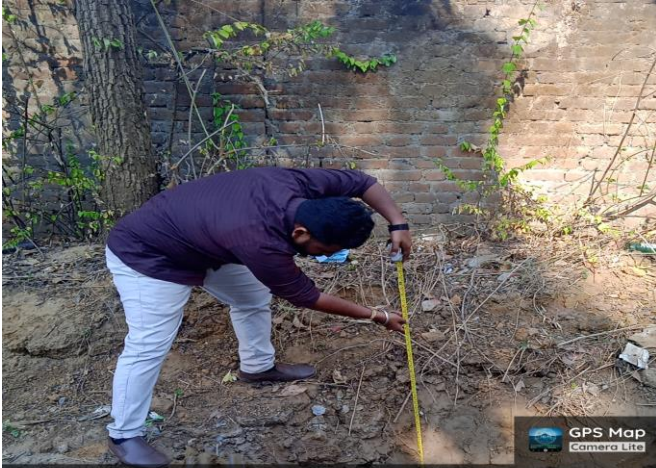
Unnamed Road, Pirayiri, Kerala 678006, India Latitude 10.7672016666666665° Longitude 76.58922166666666° Local 09:22:36 AM Altitude 67 meters GMT 03:52:36 AM Monday, 20.02.2023